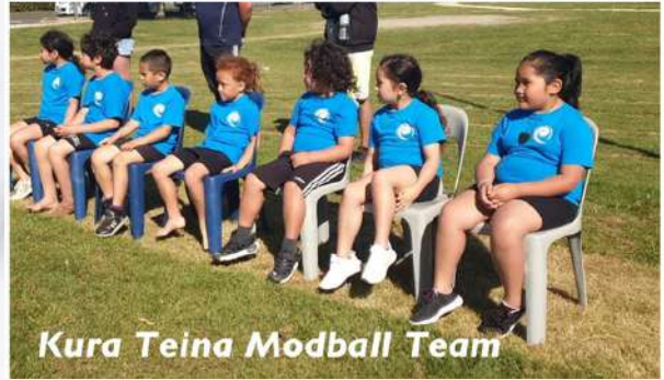
Kura Teina Modball Team