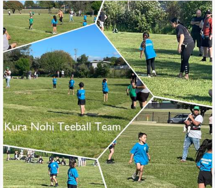
Kura Nohi Teeball Team