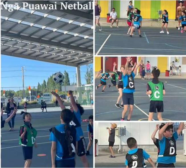
Ngā Puawai Netball