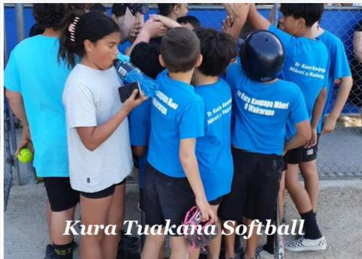
Kura Tuakana Softball