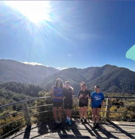
Ki te tihi o Rocky 6.3 km Piki maunga 319m