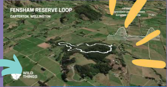
Te Ara o Fenshem 2.6 km oma ngahere